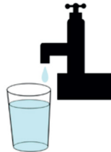
Tap water until 6:30am

Please note this includes NO sweets or chewing gum. You can have water until 6:30am