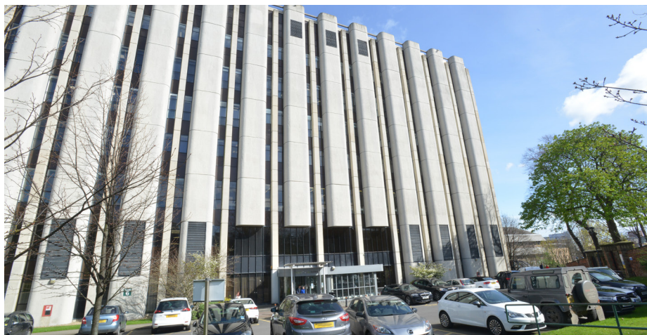
Leeds Dental Institute main entrance