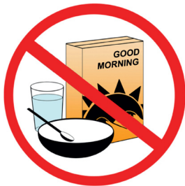
No food at all after 12:00 Midnight

No food or drink after 12 midnight except plain water until 6.30am