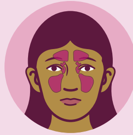
Sinusitis (swelling of the small empty spaces behind cheekbones and forehead)