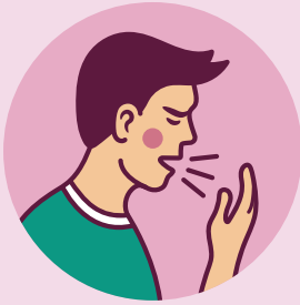
Productive, wet cough (even when well)