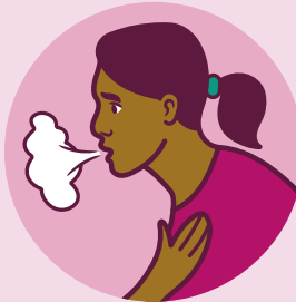
Shortness of breath / wheezing