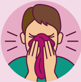
Constant runny/ blocked nose