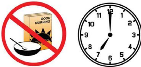
No food at all after 7am