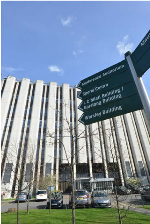
Leeds Dental Institute main entrance