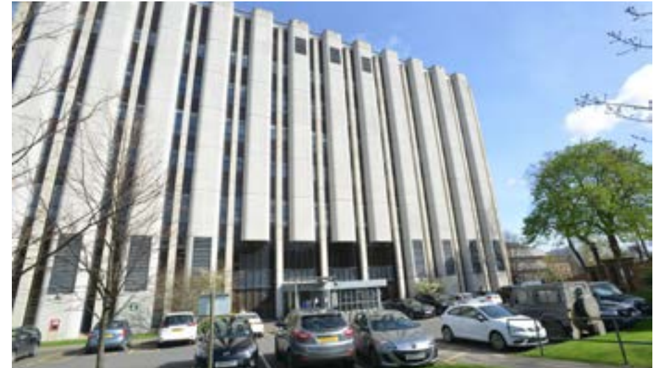
Leeds Dental Institute main entrance